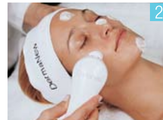
Select appropriate Microdermabrasion Crème