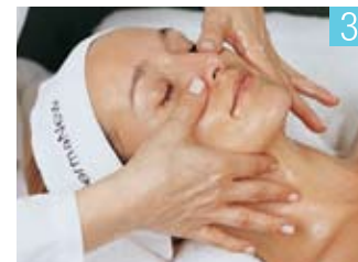
Nourish new skin